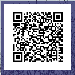
LITTLE AMERICA POND - Camp Pinnacle

We have put together a Donation List of items that we would LOVE to have for this summer and years to come. Will you think and pray about being a part of this exciting opportunity to help us prepare and stock up for a summer of faith & FUN!