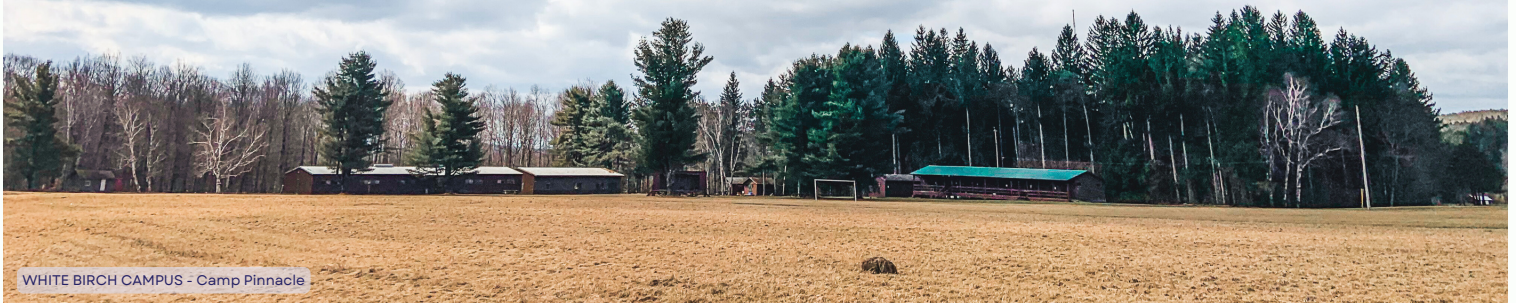
WHITE BIRCH CAMPUS - Camp Pinnacle