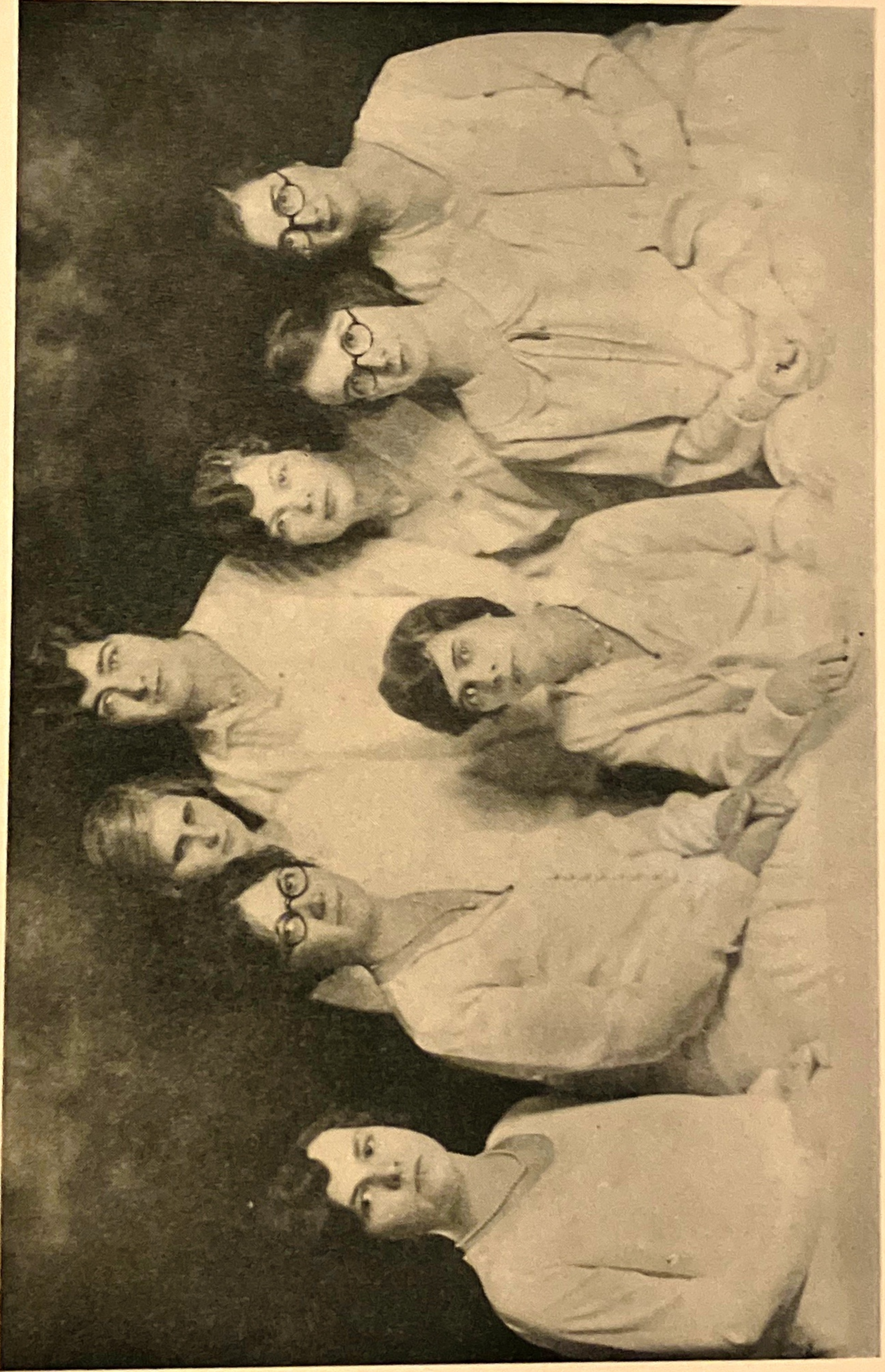
CLASS OF 1930