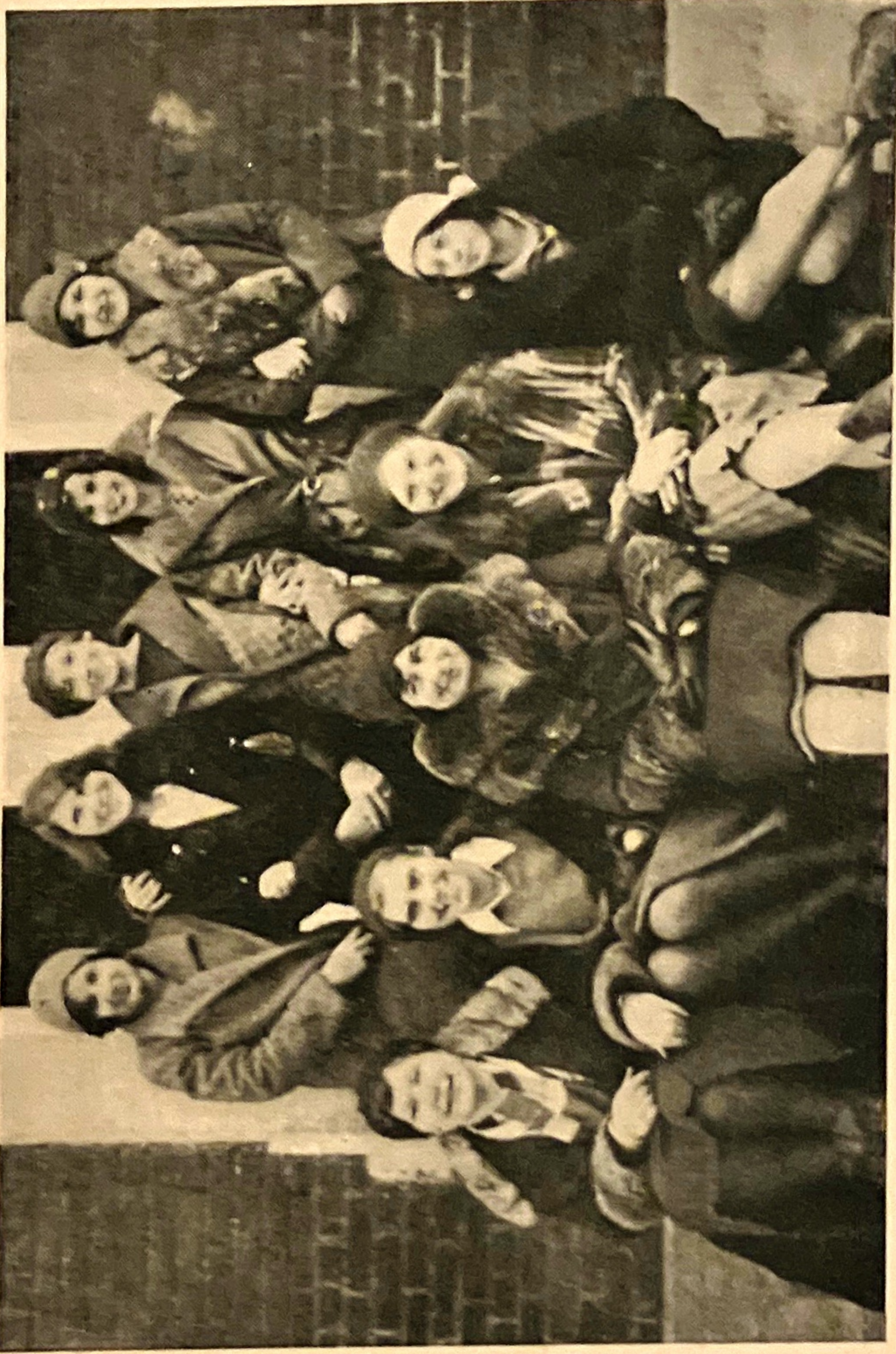
A HIGH SCHOOL EXTENSION CLASS