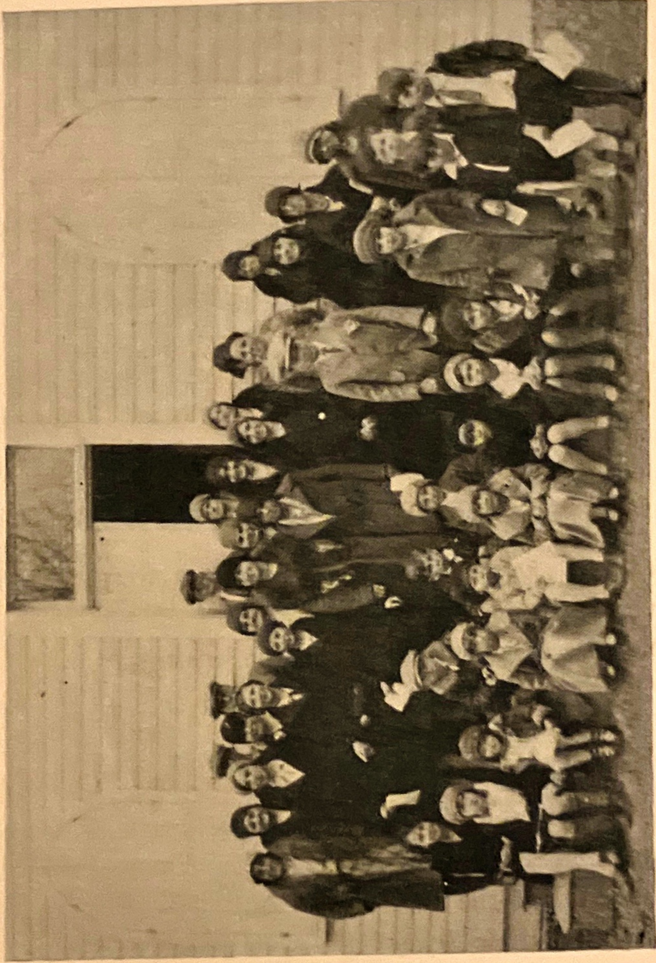
ONE OF THE SUNDAY SCHOOLS