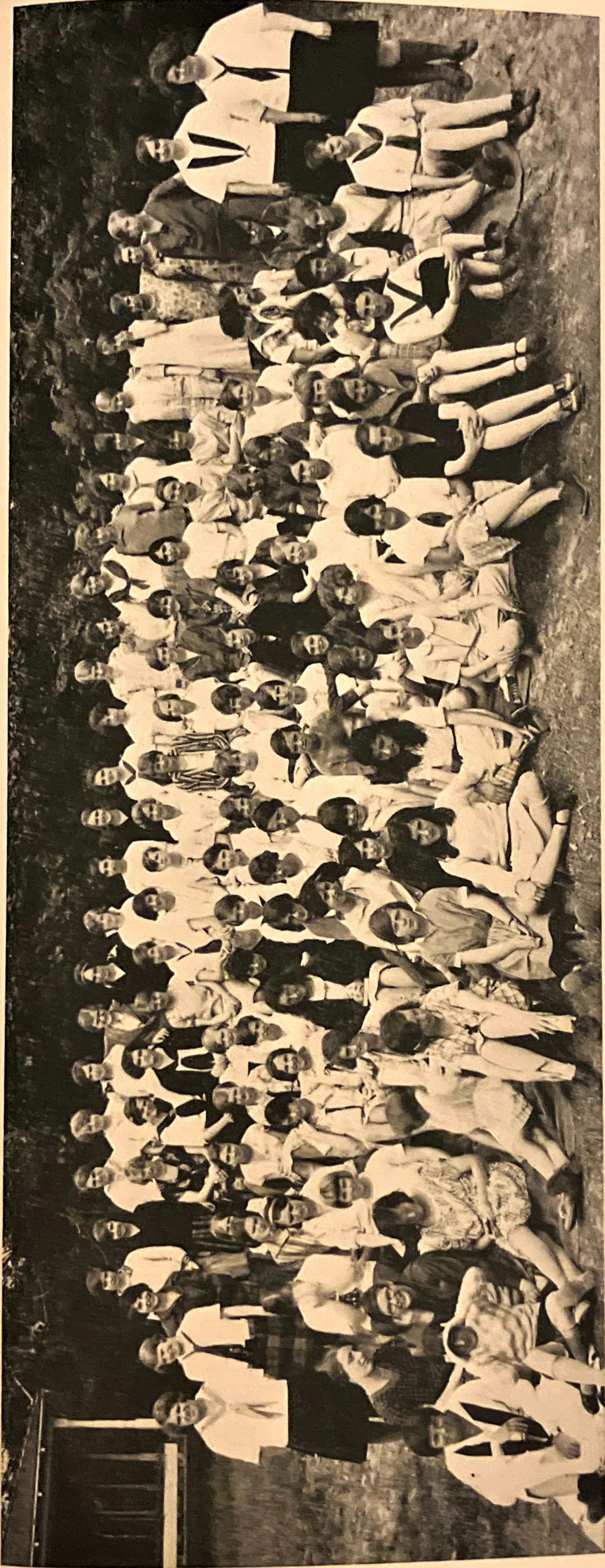
HIGH SCHOOL GIRLS' CONFERENCE AT CAMP PINNACLE